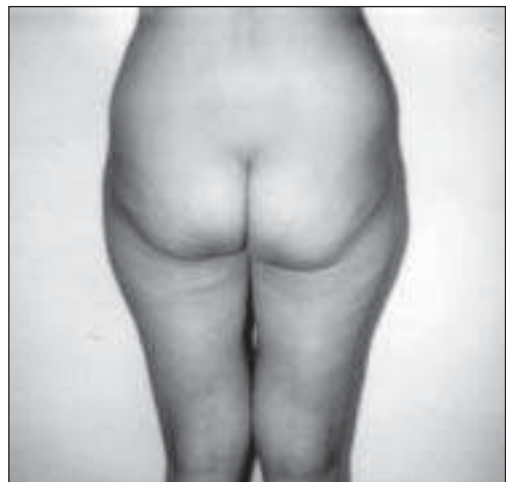
Figure 2A: Patient from the Viennese injection lipolysis study before treatment