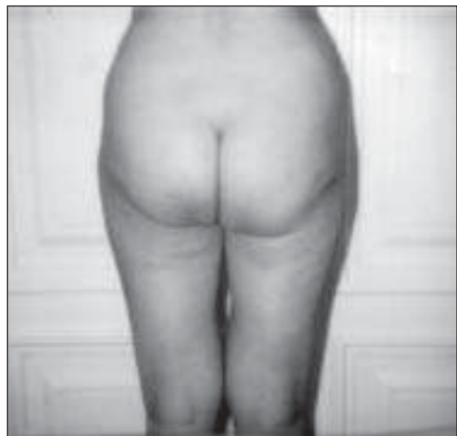
Figure 2B: Patient after injection lipolysis